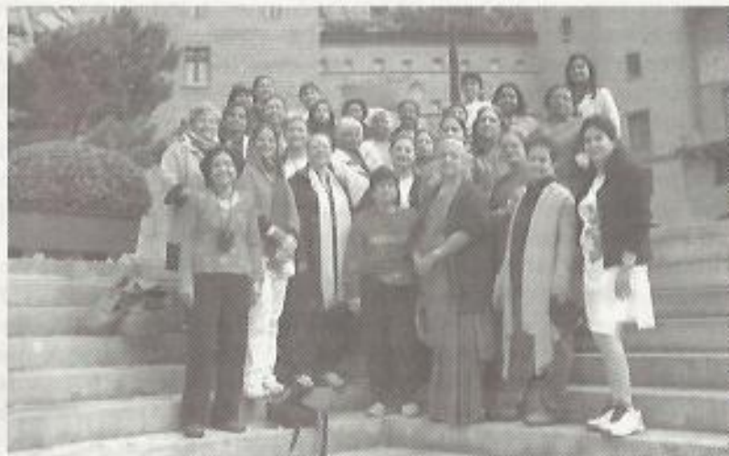
The members on the Spain and Portugal trip