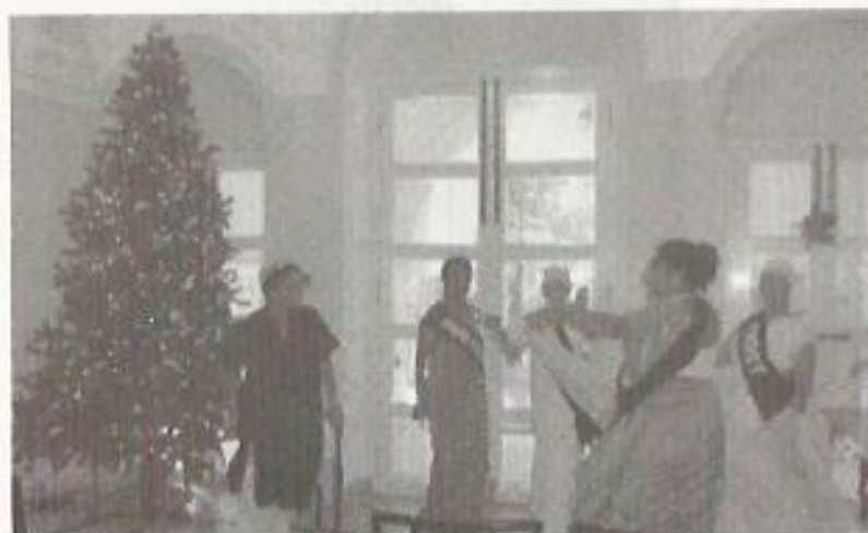
A Scene From The Gentle Giant