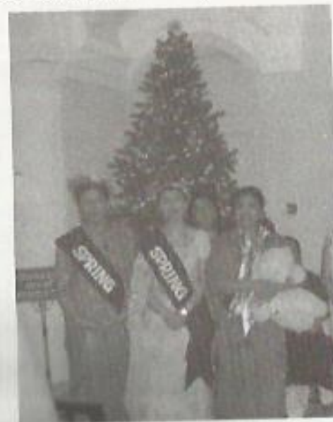
A Scene From The Gentle Giant