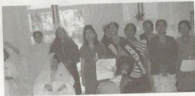
The Choir & The Nativity Scene Tableau