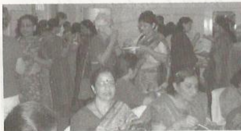
Members Enjoying The Festivities