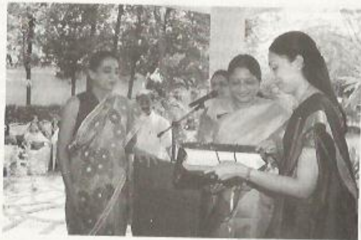
THE WEDDING PLANNER