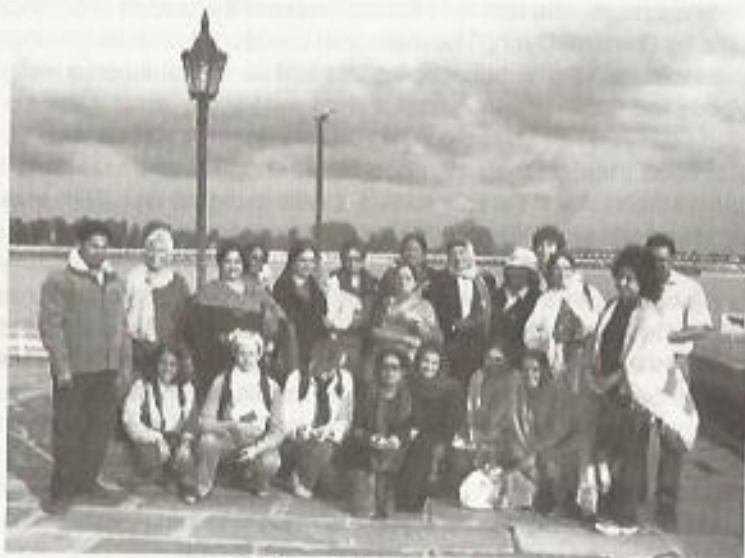
IWA GOES TO PUNJAB