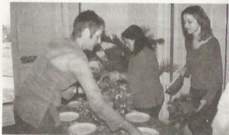
The Perfect Christmas Table