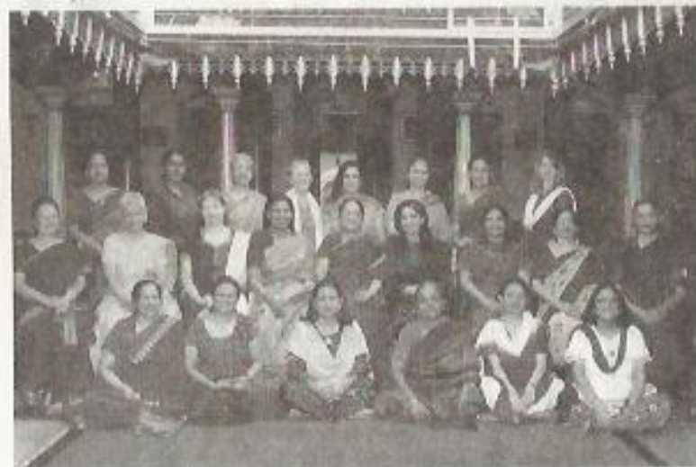
Chettinad Trip - IWA Members at A.M.M. House, Pallathur.