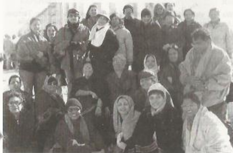
Fighting the chill at the Acropolis