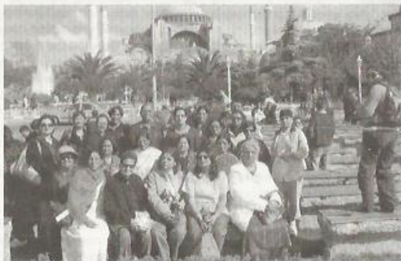
The imposing Hagia Sophia in the background