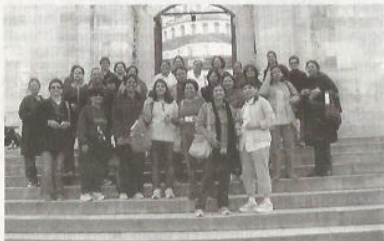
The Group outside the Blue Mosque