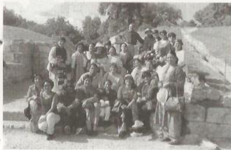
In Olympia, the site of the ancient Olympics